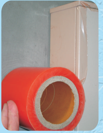
SI 36 Protecting fuse box

Like the Render Mask it will withstand up to 14 Days outdoors and the use of these two products can significantly reduce labour costs and improve customer satisfaction.